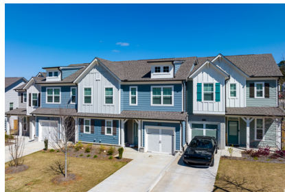
Brighton Townhomes 40 Homes | Acworth GA CONSTRUCTION FINANCING