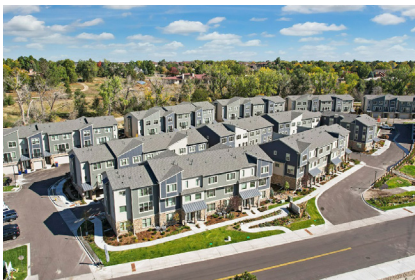
AVERE on the High Line 56 Homes | Denver CO SALE