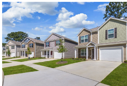
Harrison Trace 84 Homes | Charlotte NC SALE