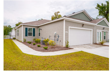
Ascend Carolina Forest 48 Homes | Myrtle Beach SC SALE & FINANCING