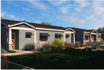
Allero 94 Land ±8 AC | Phoenix AZ SALE