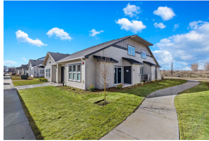
Amazon Falls 184 Homes | Eagle ID BRIDGE REFINANCING