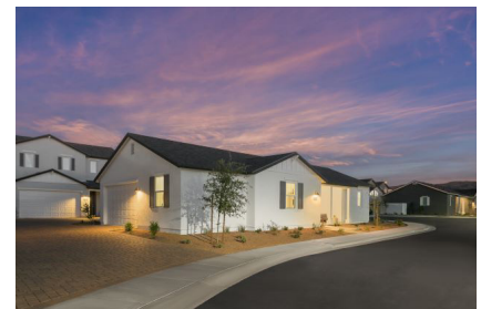
Cyrene at South Mountain 72 Homes | Phoenix AZ SALE