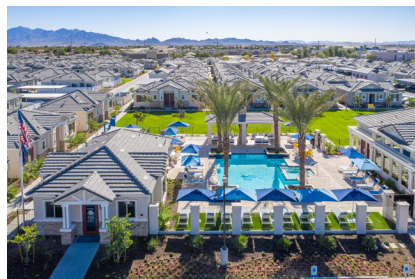
CTC at Estrella Commons 286 Homes | Goodyear AZ SALE & FANNIE MAE FINANCING