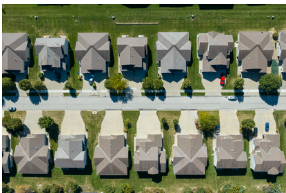
Flint Meadows Land ±27 AC | De Soto KS SALE