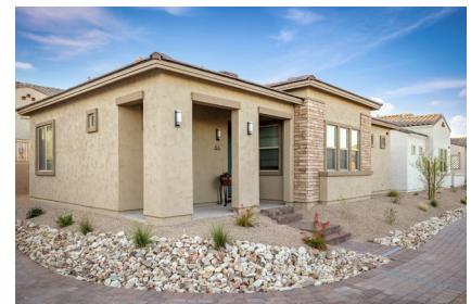
The Havenly Fountain Hills 147 Homes | Fountain Hills AZ LIFE COMPANY FINANCING