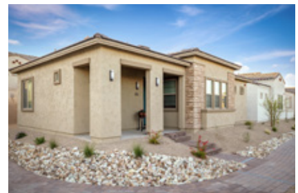
The Havenly Fountain Hills 147 Homes | Fountain Hills AZ LIFE COMPANY FINANCING