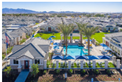
CTC at Estrella Commons 286 Homes | Goodyear AZ SALE & FANNIE MAE FINANCING