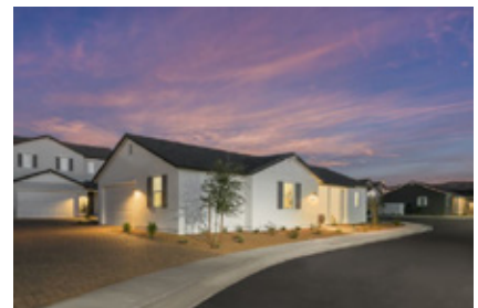
Cyrene at South Mountain 72 Homes | Phoenix AZ SALE