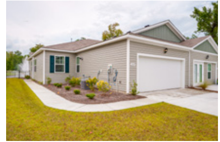
Ascend Carolina Forest 48 Homes | Myrtle Beach SC SALE & FINANCING