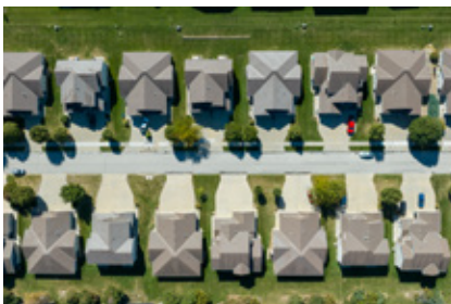
Flint Meadows Land ±27 AC | De Soto KS SALE