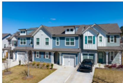
Brighton Townhomes 40 Homes | Acworth GA CONSTRUCTION FINANCING