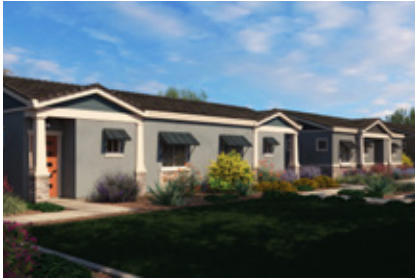
Allero 94 Land ±8 AC | Phoenix AZ SALE