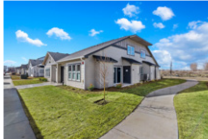
Amazon Falls 184 Homes | Eagle ID BRIDGE REFINANCING