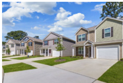
Harrison Trace 84 Homes | Charlotte NC SALE