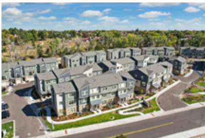
AVERE on the High Line 56 Homes | Denver CO SALE