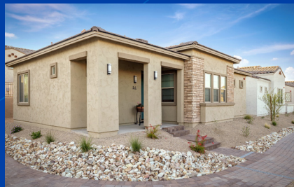
The Havenly Fountain Hills 147 Homes | Fountain Hills AZ LIFE COMPANY FINANCING