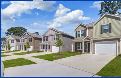
Harrison Trace 84 Homes | Charlotte NC SALE