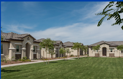
TerraLane at Canyon Trails 262 Homes | Goodyear AZ SALE