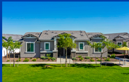
TerraLane at South Mountain 147 Homes | Laveen AZ SALE