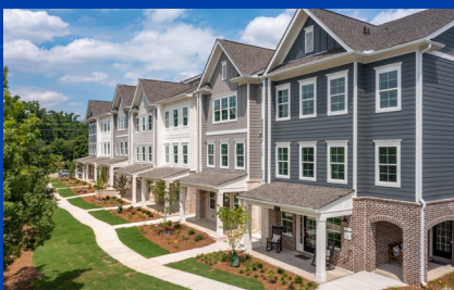
Sweetwater Springs 58 Homes | Lawrenceville GA FANNIE MAE FINANCING