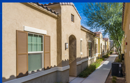
Villas at Chandler Heights 116 Homes | Chandler AZ LIFE COMPANY FINANCING