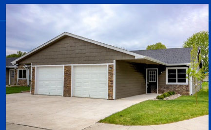
Villas at Deerwood 47 Homes | Huxley IA FANNIE MAE REFINANCING