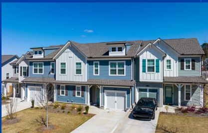
Brighton Townhomes 40 Homes | Acworth GA CONSTRUCTION FINANCING