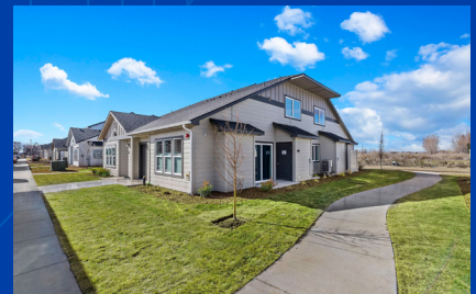
Amazon Falls 184 Homes | Eagle ID BRIDGE REFINANCING