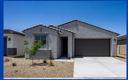
The Orchards on 12th 38 Homes | Phoenix AZ SALE