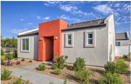
Moderne at Centennial 185 Homes | Las Vegas NV SALE & CONSTRUCTION FINANCING