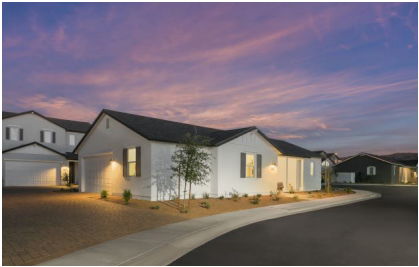
Cyrene at South Mountain 72 Homes | Phoenix AZ SALE