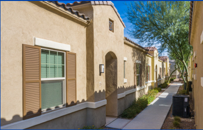
Villas at Chandler Heights 116 Homes | Chandler AZ LIFE COMPANY FINANCING