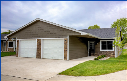
Villas at Deerwood 47 Homes | Huxley IA FANNIE MAE REFINANCING