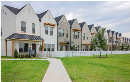
Townhomes at Bluebonnet Trails 114 Homes | Waxahachie TX SALE & FREDDIE MAC FINANCING