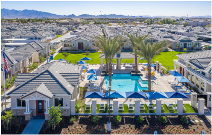
CTC at Estrella Commons 286 Homes | Goodyear AZ SALE & FANNIE MAE FINANCING