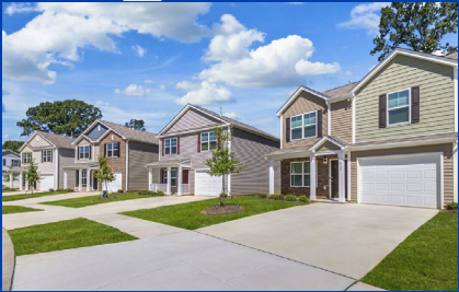
Harrison Trace 84 Homes | Charlotte NC SALE