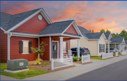
Jasper Village 208 Homes | Rincon GA SALE