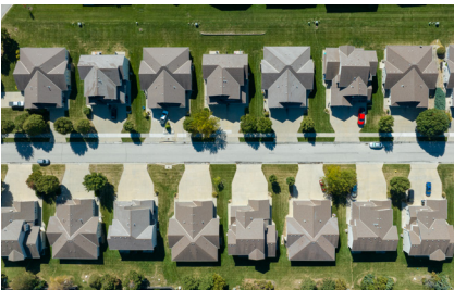
Flint Meadows Land ±27 AC | De Soto KS SALE