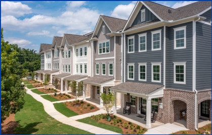
Sweetwater Springs 58 Homes | Lawrenceville GA FANNIE MAE FINANCING