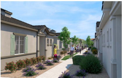
Honeycutt Run 209 Homes | Maricopa AZ SALE & CONSTRUCTION FINANCING