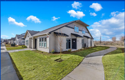
Amazon Falls 184 Homes | Eagle ID BRIDGE REFINANCING