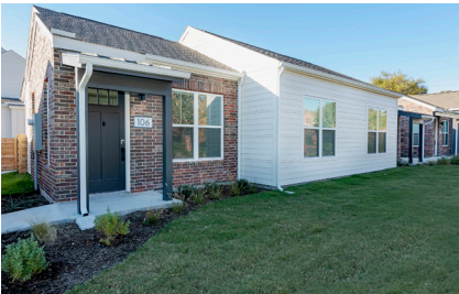
ParchHAUS at Skyline 136 Homes | McKinney TX SALE & ACQUISITION FINANCING